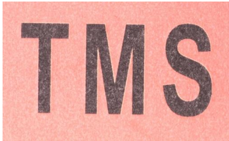
RED BACK GROUND BLACK MARK