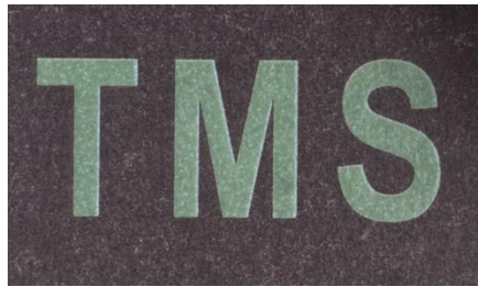
BLACK BACK GROUND GREEN MARK