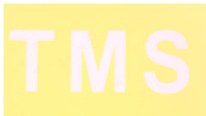
YELLOW BACK GROUND WHITE MARK